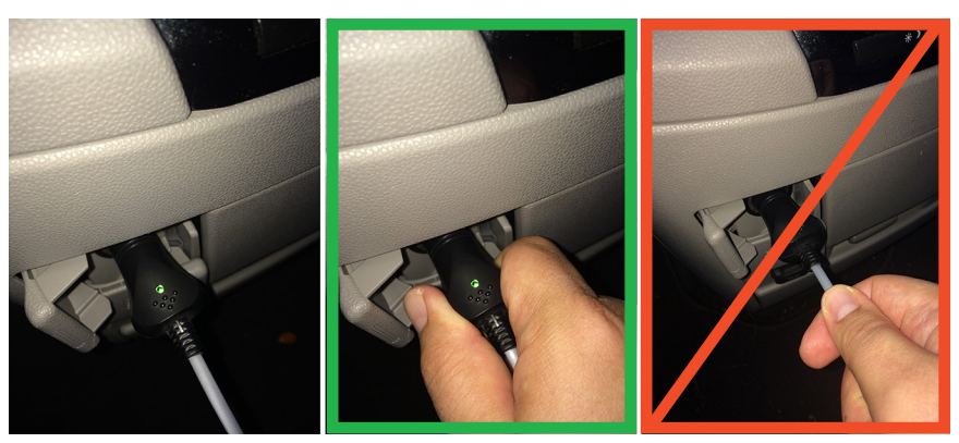
Fig. 2.6 - Proper Disconnection of Cigarette Lighter Adapter

When disconnecting the cigarette lighter adapter, be sure to grasp the base of the adapter while pulling it out, as shown below. Failure to do this may result in damage to the adapter.