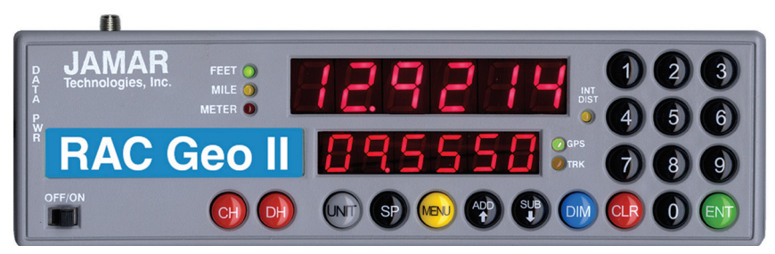
Fig. 3.1 — RAC Geo Key Layout

Your RAC Geo DMI has been designed for simple operation, using large individual keys which provide a click and tone feedback.