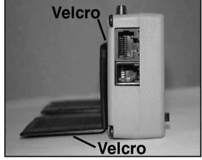
Fig. 2.3 - 'L' Bracket Side View

It is most common to mount the RAC to the front of the dashboard using the Velcro provided. Two plastic 'L' brackets are also provided to facilitate mounting to the top of the dashboard if that is your preferred location. For best results, attach the 'L' bracket so that the bottom of the 'L' is facing away from the RAC as shown in figure 2.3.