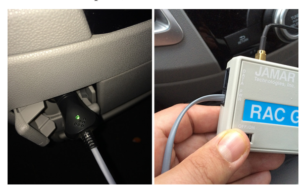
Fig. 2.5 - Connecting Power

After mounting the RAC, plug the cigarette lighter adapter into your vehicle and connect the other end to the PWR port on the RAC Geo, as shown below. (If using an external sensor, plug the power cable from your distance sensor into the RAC PWR port.)