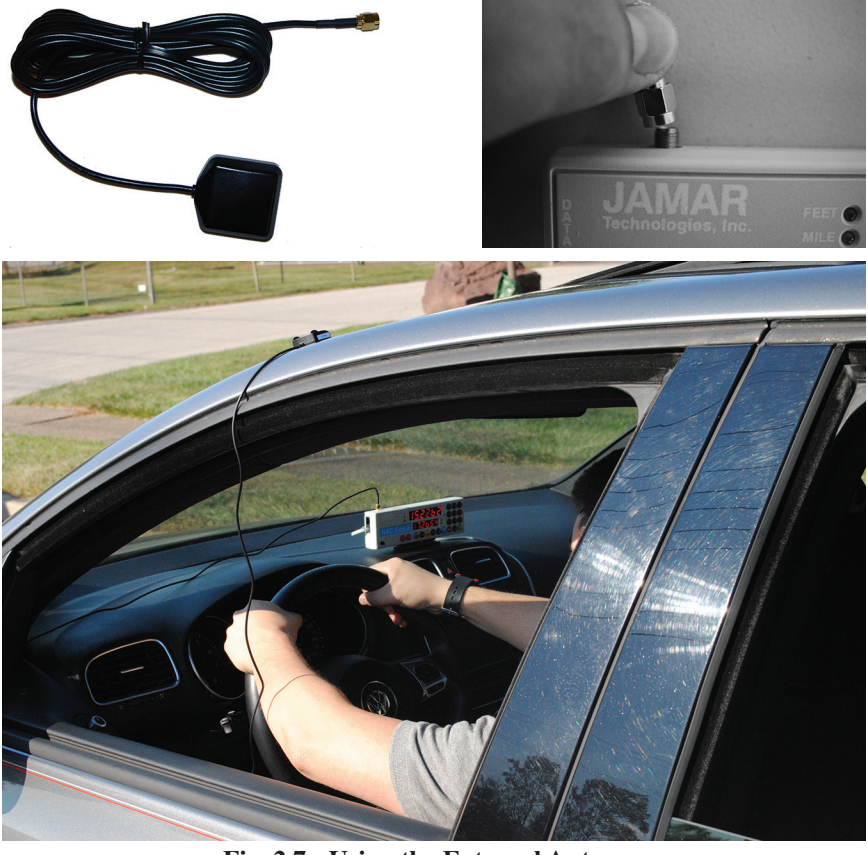
Fig. 2.7 - Using the External Antenna

Note that it is recommended that you do not touch the metal antenna connection while a count in progress as this can interfere with the GPS signal.